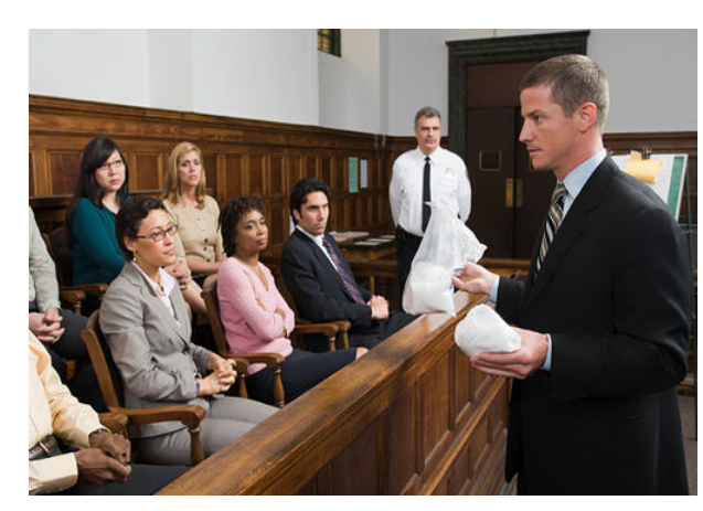
Challenges Facing The Federal Criminal Defense Bar And Strategies For Dealing With Them